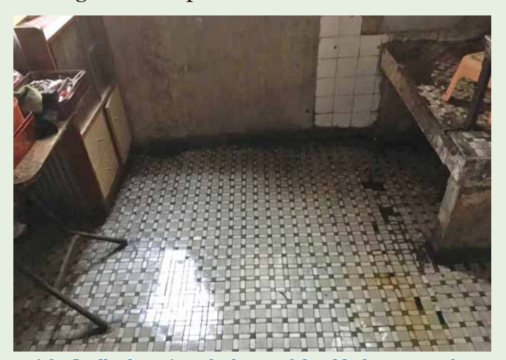
Light finally shone into the home of the elderly woman after hours of hard work by the volunteers.

After hours of hard work and many buckets of dirty, black water dumped away, retro style floor tiles began to emerge. The door which the volunteers thought was a dark brown colour started to show that it was actually a soft shade of silver. Eddie and his friends began to see light shining into the apartment.