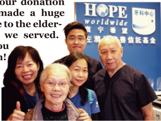
Many elderly people were delighted to receive free dental check-ups on Volunteers for Seniors Day. We then helped them connect to government resources for further treatment.

After the opening ceremony, volunteers went out to all corners of Hong Kong to