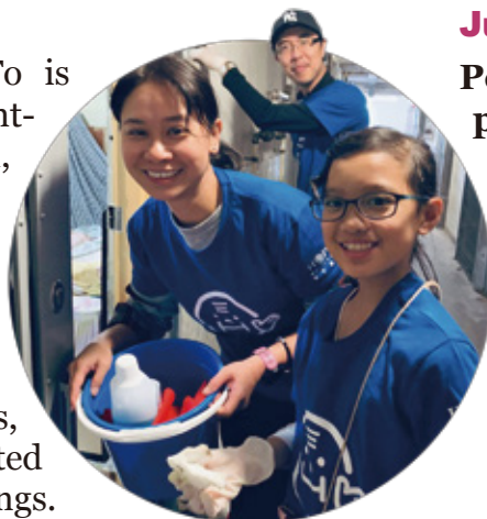
Volunteers for Seniors Day - a great opportunity to get kids involved to serve the community.