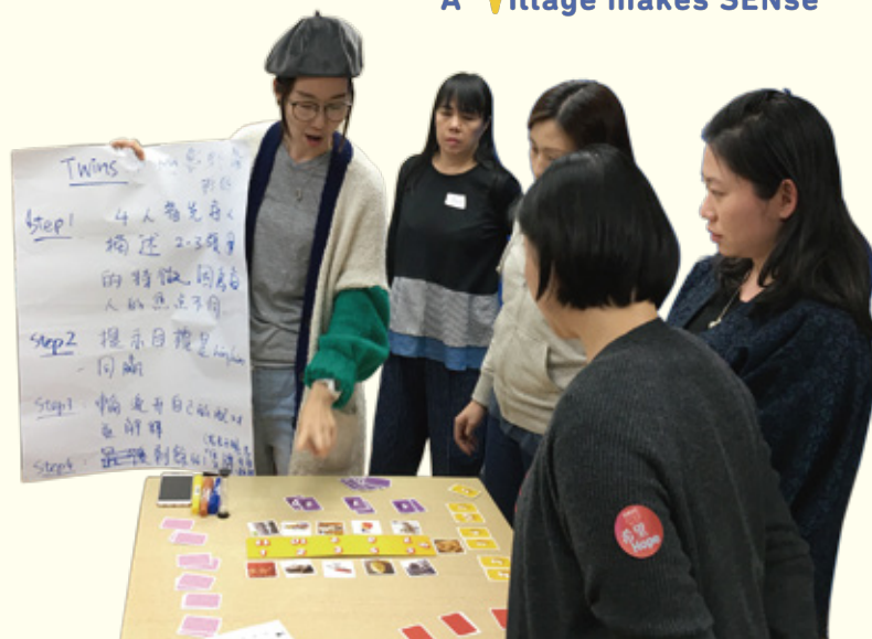
A board game played with a few rules changed can help SEN children express themselves and learn more effectively.

According to Hong Kong government statistics, the number of SEN children enrolled in public primary schools has risen by 270% since 2011. Because of you, we can respond to this growing need. Your support allows the formation of the "A Village Makes SENse" Programme. It is a one-stop learning hub built with love and care for SEN children. We will help them to not only complete their homework (a daily battle for them and their parents), but also to build skills that have direct application to the daily tasks they must master. The programme also trains people who are interested in giving SEN children after-school support, regardless of whether or not they end up serving at our centre. We believe that when more of us understand and are equipped to help, the better off the entire community.