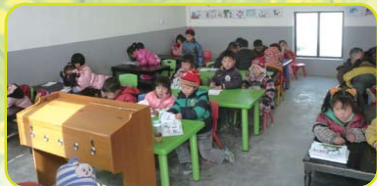
Over 130 children now can learn and grow in a bright, safe and happy place.

Monforts Fong's Textile Machinery Co., Ltd.