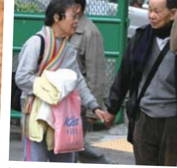
Hand in hand, this elderly couple came ready to serve!