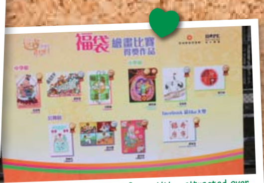
Our first Lucky Bag Drawing Competition attracted over 700 beautiful entries. Congratulations to all the winners. Well done!