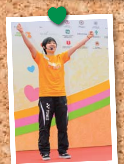
Hong Kong's badminton star Pui Yin Yip came to show us a few moves to stay agile and healthy.