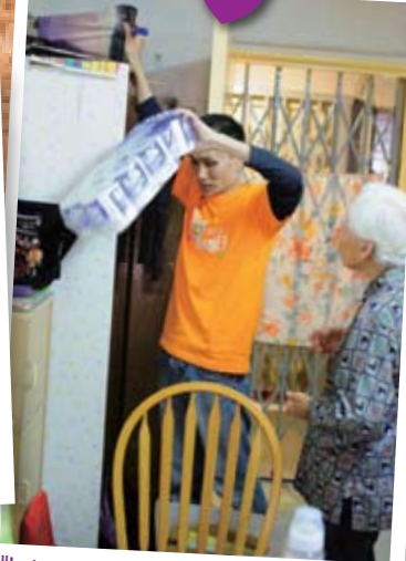
"Let me get them for you."