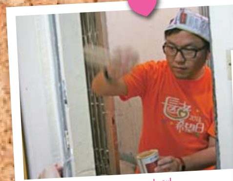
Working hard at making a new door!