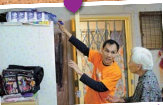
"Grandma, these things are placed too high. It's dangerous for you to climb up and down!"