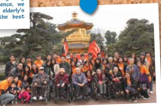
A simple outing to Nan Lian Garden fulfilled many elderly's wishes.