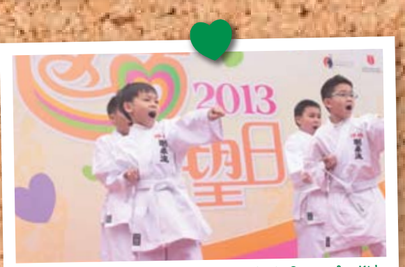
This year, members of the HOPE worldwide Centre for Kids came to encourage the volunteers!