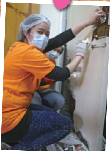
Giving the elderly a clean house to start the New Year!