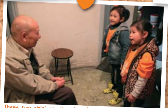
These two girls' angelic voices brought a lot of joy to the grandpa we served. -- Jacqueline Wong